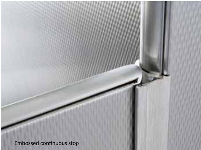
Embossed continuous stop