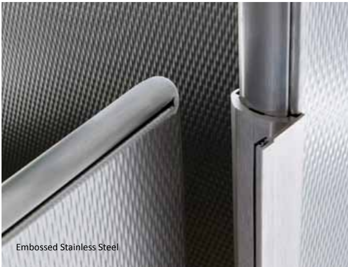
Embossed Stainless Steel