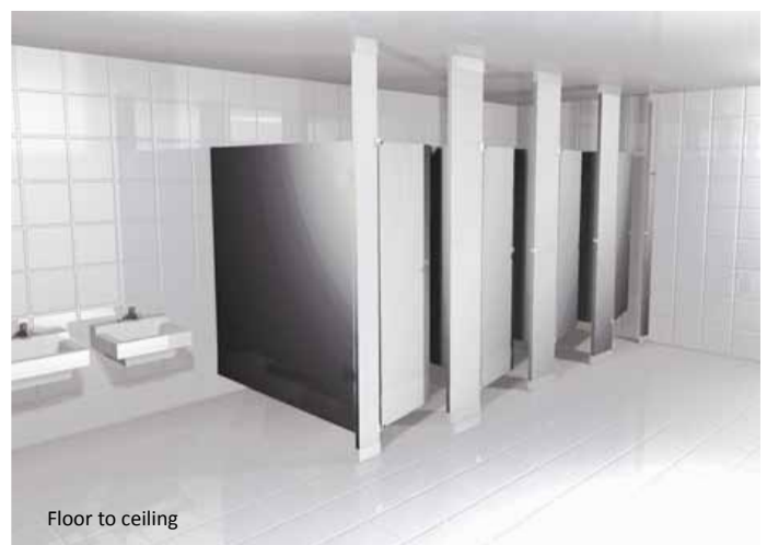
Floor to ceiling