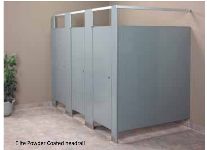
Elite Powder Coated headrail