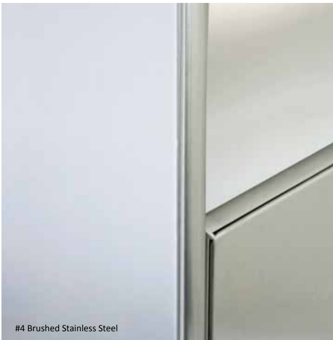
#4 Brushed Stainless Steel

The sleek and stylish gleaming appearance of Stainless Steel Toilet Cubicles lends a touch of class and contemporary design to any washroom environment.